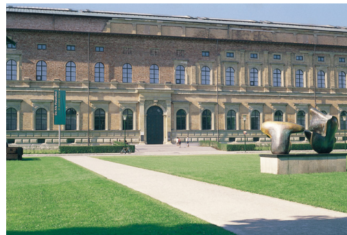
the Neue Pinakothek,

The people of Munich are also proud of the city's museums, many of which are of international standing, such as the Deutsches Museum, the world's biggest science and technology museum, the Alte Pinakothek,